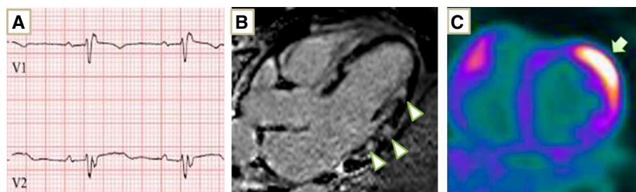
Figure 2. Typical ECG and radiographic features of cardiac sarcoidosis. (A) ECG demonstrates first-degree A-V block (P-R interval, 200 ms) and right bundle branch block. (B) Cardiac magnetic resonance showing multifocal abnormal late gadolinium enhancement involving the mid- to epicardial lateral ventricular wall (arrowheads). (C) Cardiac positron emission tomography demonstrates intense hypermetabolic uptake of ^{18}\text{F} -fluorodeoxyglucose in the lateral left ventricular wall (arrow).

Rationale for question. Given the risks and treatment implications for accurate detection of cardiac sarcoidosis, as previously discussed, definitive detection is a high clinical priority. Endomyocardial biopsy, even when aided with electroanatomic mapping guidance, is unreliable for the detection of cardiac sarcoidosis (e.g., ~13% diagnostic yield), and requires specialized equipment and skills, is invasive, and has potentially serious complications (10, 154). Thus, imaging techniques are more commonly used for cardiac sarcoidosis detection. TTE is the most widely available imaging procedure, and is shown in small, isolated studies to detect clinically symptomatic cardiac sarcoidosis (148). CMR and fludeoxyglucose F 18 ( ^{18}\text{F} -FDG) cPET are both reported to be effective for the detection of cardiac sarcoidosis (155); however, uncertainty exists on the basis of inconclusive and conflicting reports as to which imaging modality is preferred, particularly among patients with established extracardiac sarcoidosis with suspected cardiac involvement. Figure 2